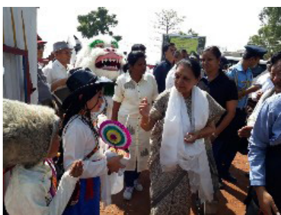
Governor of Chhattisgarh Shrimati Anandiben Patel visits Phendeling Tibetan Settlement, Mainpat amid rapturous welcome, 7 April 2019.

Tibet.net, April 9, Mainpat: The Hon’ble Governor of Chhattisgarh State, Shrimati Anandiben Patel visited Mainpat on Sunday on an official tour. Though her official program was to visit the Tibetan Monastery in camp 1, Hon Governor explored the Tibetan community in Mainpat and visited the Dhakpo monastery where all the local Tibetans offered her a rapturous welcome. Hon Smt Patel toured around the monastery; offered Tibetan white scarf at the throne of His Holiness the Dalai Lama and butter lamp. Lhamo Association of the settlement performed snow lion dance and students performed traditional