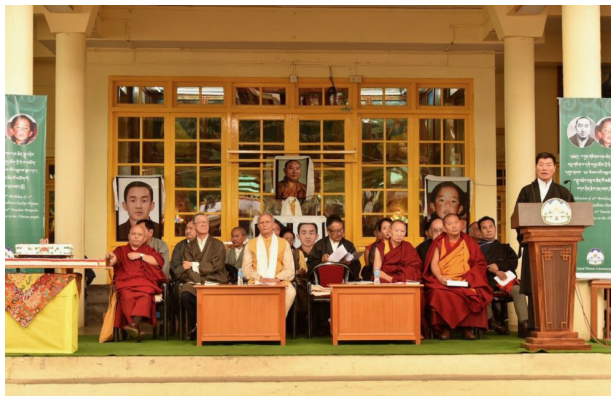
President Dr Lobsang Sangay addressing the celebration of the 30th birth anniversary of the 11th Panchen Lama and gratitude to the 10th Panchen Lama at Tsuglagkhang, 25 April 2019.

Tibet.net, April 25, Dharamshala: The rightful 11th Panchen Lama of Tibet, Kunzik Gedhun Choekyi Nyima must be released and enthroned at his seat at Tashi Lhunpo Monastery in Tibet, President Dr Lobsang Sangay said today. In a solemn ceremony at the headquarters of His Holiness the Dalai Lama, hundreds of Tibetans and supporters marked the 30th birth-anniversary of the 11th Panchen Lama in absentia. The second highest spiritual leader of the Tibetans after the Dalai Lama, Gedhun Choekyi Nyima was abducted by the Chinese authorities on 17 May 1995, just three days after His Holiness the Dalai Lama declared him to be the reincarnated Panchen Lama. He has not been heard from since.