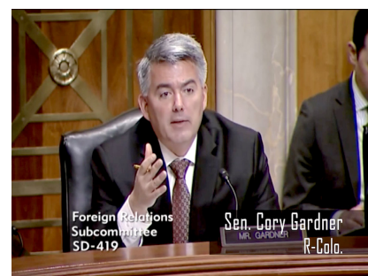
Senator Cory Gardner at the hearing of the Senate Foreign Relations Subcommittee on East Asia, the Pacific and International Cybersecurity Policy, 9 April 2019.

Tibet.net, April 10, Dharamshala: Debunking China’s latest claims over the reincarnation