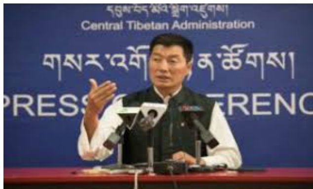
CTA President Dr. Lobsang Sangay addressing the Press Conference on upcoming Five Fifty Forum in August 2019.

Tibet.net, April 24, Dharamshala: The Department of Information and International Relations of Central Tibetan Administration is convening the Second Five-Fifty Youth Forum: Shaping Tibet’s Future from 16-19 August this year. The forum invites a select group of 100 young Tibetans from across the globe to converge at the headquarters of the Central Tibetan Administration, Dharamshala to deliberate on CTA’s Five-Fifty Vision in shaping Tibet’s political future and strengthening the Tibetan freedom movement. President Dr Lobsang Sangay formally announced the launch of the second Five Fifty Youth Forum at a press conference earlier today. President Dr. Sangay gave a brief introduction to the themes of the Five Fifty Political Forum, Youth Forum and the Resilience Forum. Reflecting upon the successful Five-Fifty Forums held in the preceding years, Dr Sangay emphasised the significance of the upcoming Youth Forum. He remained confident that the major outcomes of the preceding Five Fifty Forums will further inform the deliberations of the Special General Meeting of Tibetans scheduled in October this year in Dharamshala. “Hence the outcomes of the Five Fifty