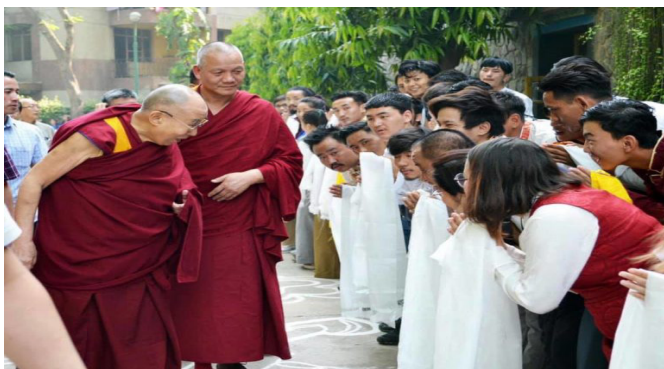
His Holiness the Dalai Lama looking hale and hearty graced a visit at Tibetan Youth Hostel, Delhi.

“Look at my face, I am totally fine now. You do not need to worry,” assures His Holiness the Dalai Lama