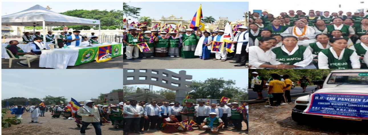
Tibet Support Groups members with marchers