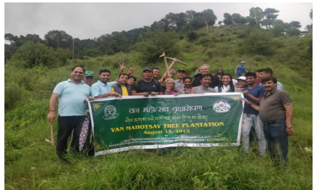
Representative of the Indo-Tibet Friendship Association and Tibetan Settlement Office Dharamshala at the Tree Plantation event.

TSO, Aug. 16, Dharamshala: On 15 August (Independence day of India), Indo-Tibetan Friendship Association Dharamshala collaboration with Tibetan Settlement Office have performed Tree Plantation initiative near Heeru Village School. Indo-Tibetan Friendship Members, Staff of Tibetan Settlement Office, Representatives of Tibetan NGOs and Indian NGO's, General Public both Indians and Tibetans participated in the Tree Plantation event. There were total numbers of 80 to 85 participants at the event. About 200 Tree Saplings such as Pajja (Local Tree), Silver Oak, Bottle Brush, Kachnar, Duri and others have been planted. After the Tree Plantation, Adventure Operator Association served lunch to all the participants.