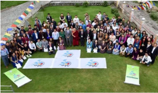
A group picture of the participants with President Dr Lobsang Sangay and the organising team of DIIR.