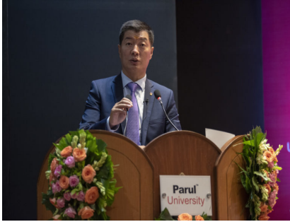
President Dr Lobsang Sangay addressing the audience at Parul University.