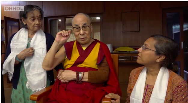
His Holiness the Dalai Lama explaining the relevance of India's ancient traditions to a group of Indian audiences.

OHHDL, Aug. 6, Dharamshala: During a meeting with a group of Indian audiences at his residence, His Holiness the Dalai Lama spoke on the relevance of India's ancient traditions in today's world. Explaining further, His Holiness the Dalai Lama remarked that ancient India's traditions is all about non-violence, compassion, single pointed concentration and analytical meditation. "We do not follow faith, but analyse", said His Holiness the Dalai Lama which he noted was the very advice of Buddha himself. His Holiness mentioned some of the great masters and scholars of Nalanda like Nagarjuna, Buddhapalita and Chandrakirti who used to analyse Buddha's own words and if found any contradiction in Buddha's teachings, they forthright rejected it. His Holiness attested that he is the follower of one such tradition that encourages scientific way of thinking and analysing rather than promoting blind faith in the religion. His Holiness affirmed his respect for all religions and said they are wonderful but admitted