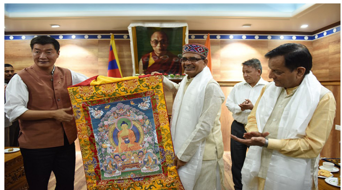
President Dr Lobsang Sangay presents a memento of Shakyamuni to the Honourable former Chief Minister.