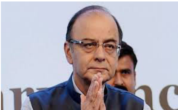
Shri Arun Jaitley (1952 – 2019)

ITCO, Aug. 26, New Delhi: His Holiness the Dalai