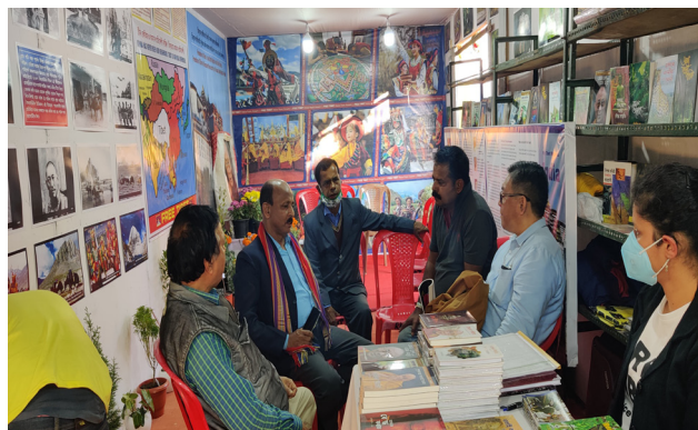
ITCO-Coordinator interacting with dignitaries at the Tibet Stall