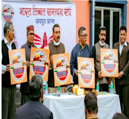
Formal launch of BTSS Logo by the dignitaries