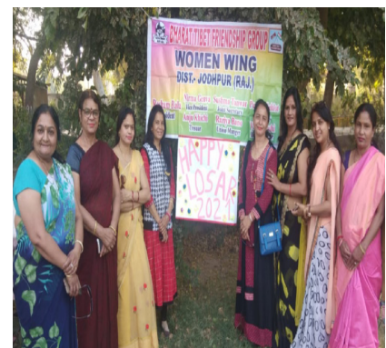
ITFS Jodhpur(Women Wing) wishing all Tibetans on the auspicious occasion of Losar

ITFS, Feb 13, Jodhpur: India-Tibet Friendship Society, Jodhpur (Women Wing) celebrated