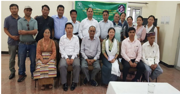
Group picture of the participants who participated in the round table discussion on 11th Panchen Lama.