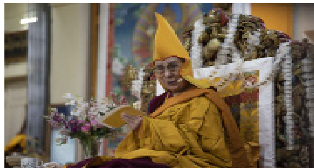
His Holiness the Dalai Lama at the main temple earlier today at the long life prayer ceremony offered by Former staff members of CTA.

Tibet.net, July 5, Dharamshala: Long life prayer offering, Tenshug was held at the Main temple this morning which is organized by the Former staff members of the Central Tibetan Administration. Many former staff members including Cabinet Ministers, Chief Justice, Secretaries and others have gathered from all across the world to offer the long life prayer for His Holiness the Dalai Lama. His Holiness the Dalai Lama greeted the former officials at the main temple as he was escorted towards his throne. The prayer to Buddha of daily practice in