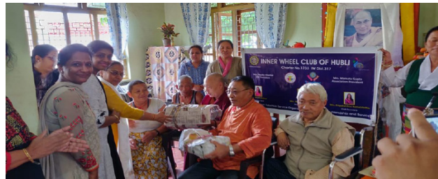
The members meeting Old Age Home people.