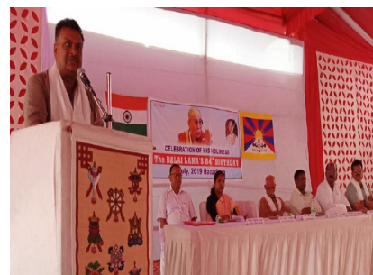
His Holiness the Dalai Lama's birthday celebration in Hazaribag, Jharkhand.