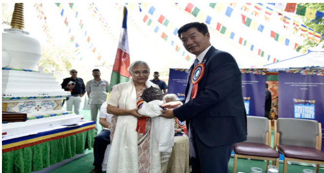
CTA President Dr Lobsang Sangay with former Delhi CM Smt Sheila Dikshit at the inaugural ceremony of Cultural Festival of Tibet, IIC, 2 April 2018.

Tibet.net, July 20, Dharamshala: President Dr Lobsang Sangay condoled the demise of veteran Indian leader and former Delhi Chief Minister Sheila Dikshit who passed away at the age of 81 after suffering a cardiac arrest on Saturday. Extending his heartfelt condolences to family and loved ones of Smt Sheila Dikshit, Dr Sangay said he was deeply saddened to hear that the veteran Indian leader and dear friend of Tibet is no more. “A stalwart Congress leader, Former Union Minister, Member of Parliament and longest serving Chief Minister of Delhi, Smt. Sheila Dikshit devoted her entire life to the service of the nation and society. Throughout her 15-year stint as the Chief Minister of Delhi, she made immense contribution to the state and her governance ushered all-round development of the national capital,” the President said. Furthermore, he said, “She was a staunch supporter and long time friend of Tibet and Tibetan people who had deep reverence for His Holiness the Dalai Lama.