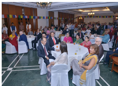
Dinner reception organised by the Bureau of His Holiness the Dalai Lama, New Delhi.