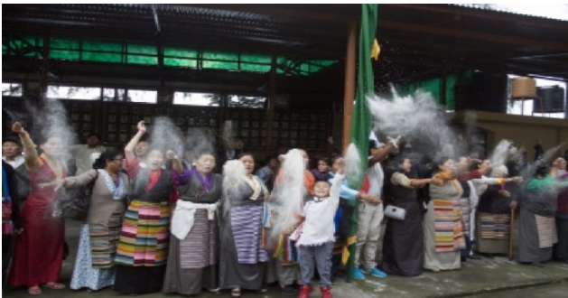
Tibetans in exiles throw barley flour in the air at the end of prayer session in Dharamsala. (File Photo)

IANS, July 16, Dharamshala: For Tibetans in exile, the Indian government and people of India have done a lot for Tibet. Even Tibetan spiritual leader the Dalai Lama calls himself a "son of India". However, they say if the people in Tibet were to get more autonomy within the Chinese constitution it could be achieved only through the political support of India and its people. "China has occupied Tibet and we expect India has the only legitimacy and credibility to speak about Tibet," a senior Central Tibetan Administration (CTA) functionary told IANS on Tuesday. "It is due to India's consistent generosity and kindness, we, the people in exile, have been able to preserve