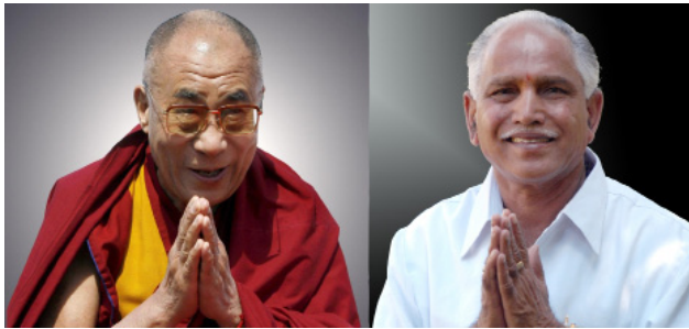
His Holiness the Dalai Lama congratulates B.S. Yediyurappa.

Tibet.net, July 29, Dharamshala: His Holiness the Dalai Lama conveyed his congratulations to B.S. Yediyurappa on his once again becoming the Chief Minister of Karnataka. “I trust that under your leadership the people of Karnataka will see prosperity and progress,” he wrote. “I particularly hope that you will strive to improve the lives of the less privileged people in the State. “Last April marked the 60th anniversary of our life in exile. As you know, over 30,000 Tibetans reside in Karnataka State, perhaps the largest number among Tibetans in exile. In fact, I attended a special function in Bengaluru last year to thank the state of Karnataka and its people for their friendship and support. I am proud to state here that our main Centres of Learning, based on the Nalanda Tradition of Ancient Indian Wisdom, have been re-established in Karnataka. “This has been made possible thanks largely due to the most generous response to an appeal by Prime Minister Jawaharlal Nehru from then Chief Minister S. Nijalingappa, who I had first met when