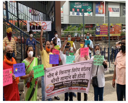
TSGs members campaign to ban Chinese products

ITCO, Nov. 9, Delhi: Amid the COVID-19 pandemic in tune with the countrymen, the Tibet Support Groups in India carried out campaigns against Communist China and called for the complete boycott of buying and using of Chinese products. In June 2020, Bharat Tibbat Sahyog Manch (BTSM) in Delhi organized Boycott Chinese Products cum Mass Public Awareness Campaign to ban Chinese products and burned Chinese President Xi Jinping effigy in protest against the killing of brave Indian soldiers by the Chinese soldiers. In July 2020,