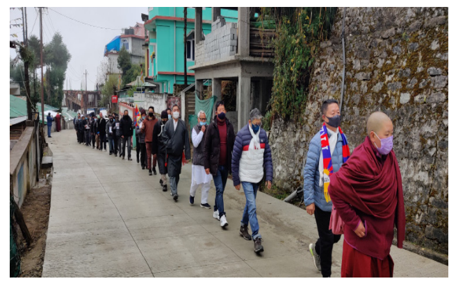
Core Goup members followed by local people during the peace march