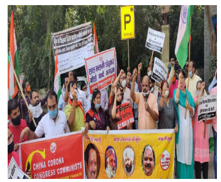
BTSM members protesting against Communist China

Bharat Tibbat Sahyog Manch protests on the 58th Anniversary of Sino-India War