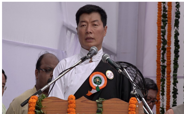
President Dr Lobsang Sangay addressing the National Convention on Tibet organized by Bharat Tibbat Sahyog Manch. 22 September 2019.