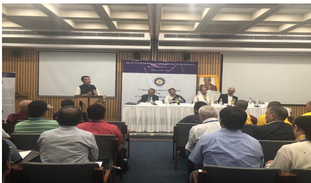
Kalon Choekyong Wangchuk, Department of Health, CTA addressing the gathering at India International Centre in New Delhi on 11 September 2019.

Tibet.net, Sept 11, New Delhi: Kalon Choekyong Wangchuk, Minister of the Department of Health of the Central Tibetan Administration made a formal request for the appointment of Sowa-Rigpa advisor in the Ministry of Ayush of the Government of India during a celebration marking the 1st Sowa-Rigpa, (generally known