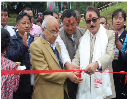
Hon'ble Minister for Tourism & Civil Aviation and Commerce & Industries Shri Bedu Singh Panth inaugurates the grand celebration of the 36th Pang Lhabsol at Ravangla on 3 September 2019.