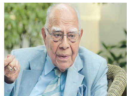
Ram Jethmalani (1923 - 2019)