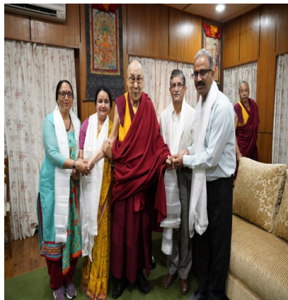
His Holiness the Dalai Lama with the faculty of Dharamshala Government College at his residence on 9 September.

College yesterday who have come to seek His Holiness blessing and guidance on their newly introduced six-month certificate course on the ‘revival of ancient Indian knowledge and tradition’. His Holiness the Dalai Lama met the group at his residence and shared some profounding message on secular ethics. His Holiness mentioned that most of the problems facing the world today are essentially created by human beings. His Holiness denoted that more often than not humans are prone to use