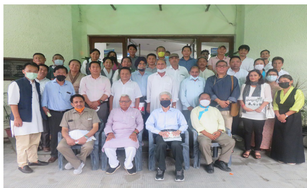
Tibet Support Groups in Paonta Sahib, Himachal Pradesh

29th Aug. 2021, Delhi: With the aims to re-strengthen and re-ignite the flame of Tibbat Mukti Sadhana, the Core Group for Tibetan Cause – India (CGTC-I) in