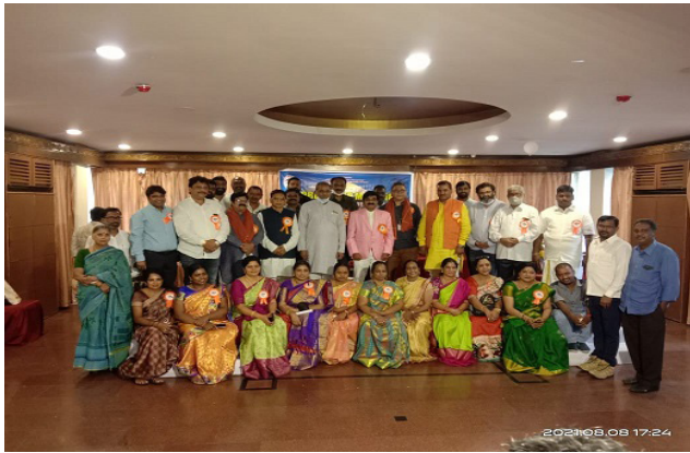
Bharat Tibbat Samvad Manch - South Region members with dignitaries

8th Aug. 2021, Hyderabad: Under the banner of Bharat Tibbat Samvad Manch, its Core Committee Members organized South Region Coordination Meeting at Country Club, Begumpet, Hyderabad. on 8th Aug 2021. Representatives from six South Indian states of Andhra Pradesh, Telangana, Karnataka, Tamil Nadu, Puducherry and Kerala; and local supporters attended the meeting. The meeting was organized with an intention of reflecting the urgency of adding more energy and amplification of protest Chinese Communist