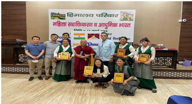
Tibetan representatives at the program

14th March, New Delhi: Observing the International Women’s Week, HimalayaPariwar - an Indian Tibet Support Group organized a program on Women