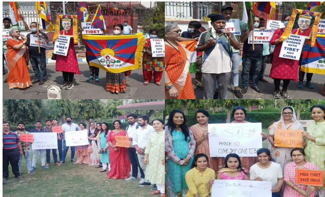
TSGs in Kolkata and Jodhpur commemorating the 63rd Tibetan National Uprising Day