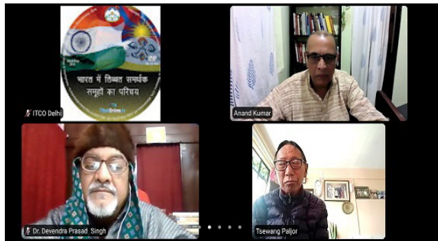
ITFS Members at the virtual meeting “Bharat Tibbat Maitri Sangh Samvad”