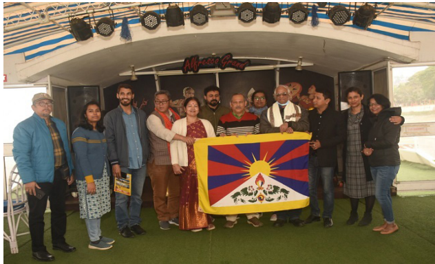
Members of Free Tibet - A Voice from Assam, BTSM and other individual Tibet Supporters in Guwahati