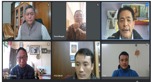
Participants during the virtual meeting in regard to ITFS Kalimpong