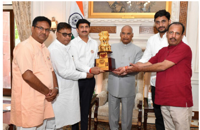
BTSS special delegation presenting a memento to President Ram Nath Kovind

departments related to which proposals should be sent. He said that some of these proposals are related to the Ministry of Home Affairs and some proposals are related to the Ministry of Defence, so he will send his recommendations to the respective ministries. During this 25-minute meeting with His Excellency, he was ready after knowing in advance about the work of Bharat Tibbat Samanvay Sangh and while discussing the issue of Tibet and Kailash, His Excellency gave suggestion to create a mass movement to create public awareness and bring forward the youth power. He said that this work of the Sangh is going on with very big objectives, in which it is also good that it is being led by a senior campaigner of Rashtriya Swayamsevak Sangh, BJP’s Organization Secretary and former Governor, Prof.