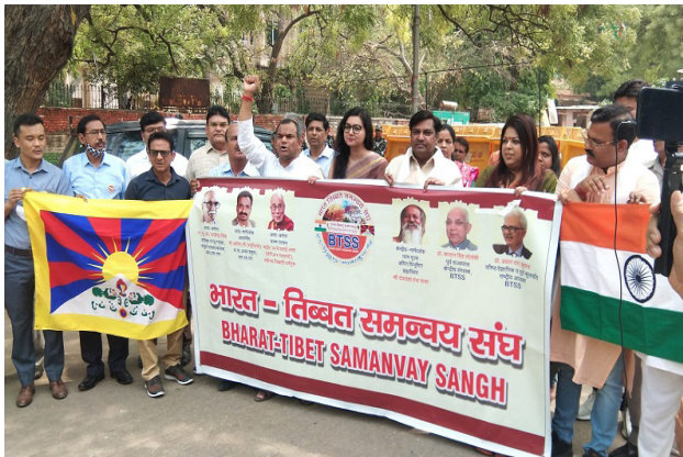
BTSS members protesting against Communist China at Jantar Mantar, New Delhi