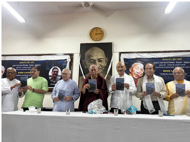
“Tumhara Naam Kya Hai - Tibbat” being launched by His Eminence Prof. Samdhong Rinpoche with other dignitaries